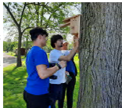
Newfane students hanging a blue bird box

Lockport students expanded and improved a pollinator habitat in the Olcott Harbor. Work included removing undesirable species, planting winterberry and milkweed seedlings, and spreading pollinator seeds.