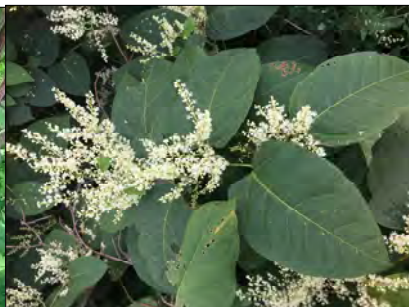
Top photo: Japanese knotweed new growth stems; Bottom left: Knotweed stems; Bottom right: Japanese knotweed flowers and leaves