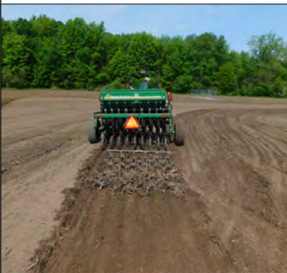
Photos are from the recent planting of a grassland and pollinator habitat in Hartland.

The Town of Hartland and the Niagara County Federation of Conservation Clubs worked with District employees to plant a grassland and pollinator habitat behind the town park. The no-till drill was used to plant warm season grasses and wildflowers on almost five acres.