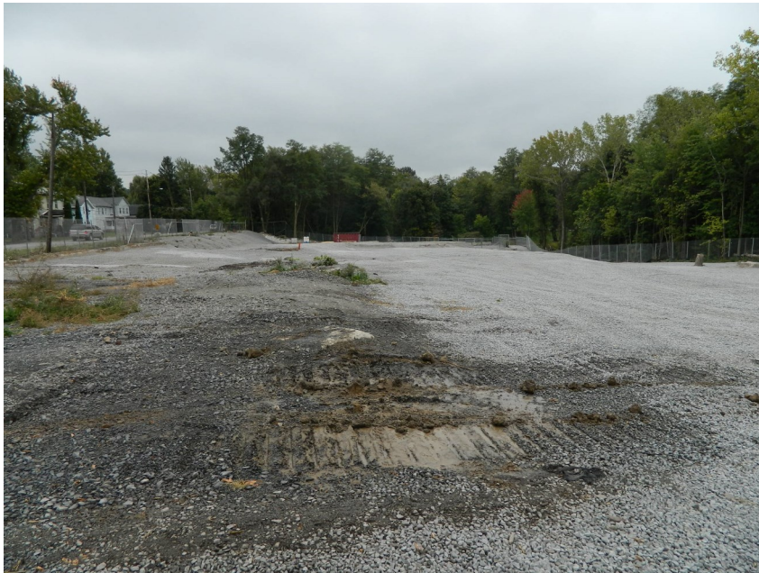
Figure 1. Former Flintkote building, looking South.

With the demolition of the Flintkote building, relocation of the families on Water Street, and the demolition of their homes, OUI is nearly completed. EPA is now in the process of finishing up the Remedial Investigation (RI) which will be used in deciding what remedial actions will be used to clean up the sites. The properties on water street and the Flintkote building are now clear and awaiting a final remediation measure.